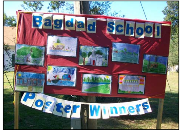
Bagdad Elementary School students had a poster contest for the Art Stroll. Winning posters were displayed in the entertainment and food area. Winners received $5 gift cards.

The Bagdad Waterfronts Florida Partnership created the Front Porch Art Stroll in 2006 to promote appreciation of the historic and natural beauty of Bagdad. For hundreds of people, this year's Stroll was their first time experiencing Bagdad from outside of an automobile. ■